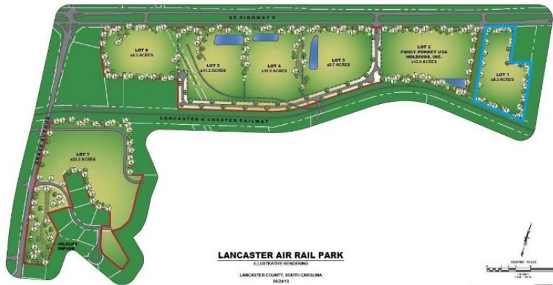
LANCASTER AIR RAIL PARK ILLUSTRATIVE RENDERING LANCASTER COUNTY, SOUTH CAROLINA 10/2015